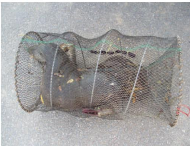
Otter caught in a crayfish trap.

Would you want to be responsible for this?